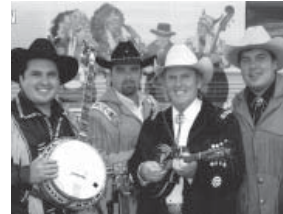
GOLDWING EXPRESS (Friday, 19th)