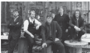
THE STEEP CANYON RANGERS (Friday, 19th)