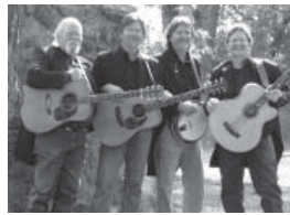
THE TENNESSEE GENTLEMEN (Thursday, 18th)