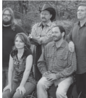
THE STEELDRIVERS (Saturday, 20th)