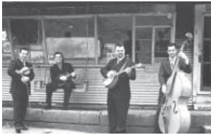
THE TRAVELIN' MCCOURYS (Saturday, 20th)