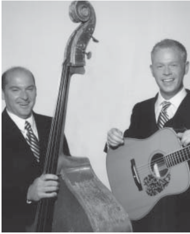
DAILEY & VINCENT "Winner of (7) 2008 IBMA Awards Including Entertainer of the Year" (Thursday, 18th)