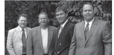
DRY BRANCH FIRE SQUAD (Saturday, 20th)