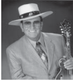
BOBBY OSBORNE & ROCKY TOP X-PRES "Grand Ole Opry" (Saturday, 20th)