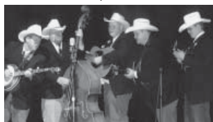
THE BLUEGRASS BROTHERS (Friday, 19th)